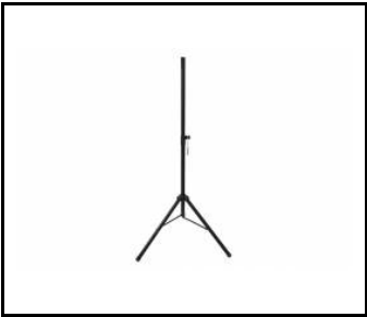
Standard tripod (000720)

Card creation date: 08 November 2023 The company reserves the right to make design changes or upgrades in the presented product. Product data sheet does not constitute an offer. * Parameter tolerance is +/- 10%