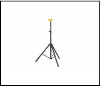
FUTURE STAND Tripod with Click Head System (000737)