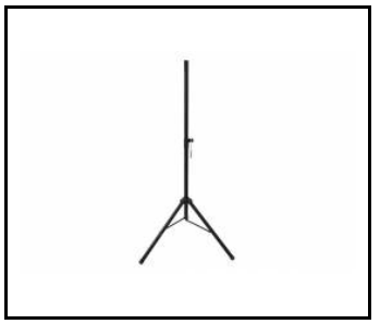
FUTURE STAND Tripod with Click Head System (000737)