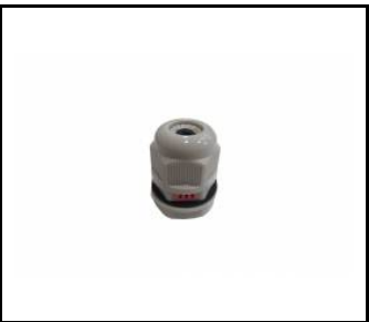
Breathable gland gray M20*1.5 IP68 (16000507)