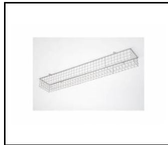
TYTAN LED. ATLAS LED - protective grid 1432mm (907920)