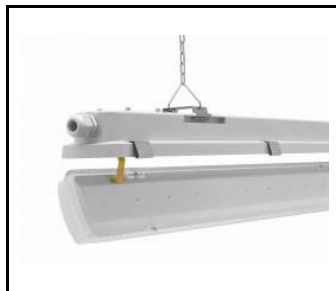
system zwieszania klosza / suspension system of the diffuser / hängende Diffusor