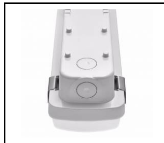
wybór miejsca zasilania / choosing a place of power supply / Stromversorgungsanschluss von mehreren Seite möglich