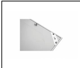
PLANO LED EVO 1