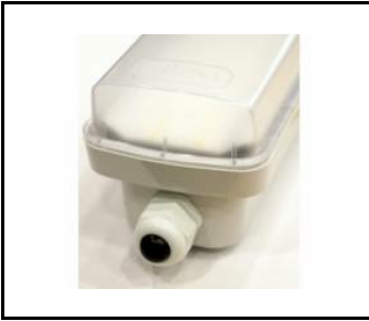
M16 stuffing box plug various PA black M-16 - BPM-21 (60000006)