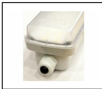
M16 stuffing box plug various PA black M-16 - BPM-21 (60000006)