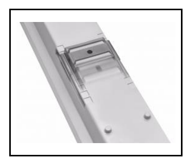
regulowane uchwyty / adjustable handles / einstellbare Halterungen