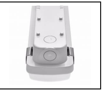
wybór miejsca zasilania / choosing a place of power supply / Stromversorgungsanschluss von mehreren Seite möglich