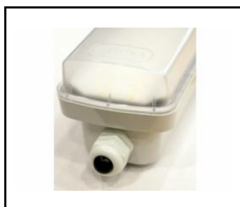
M16 stuffing box plug various PA black M-16 - BPM-21 (60000006)