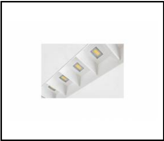
TERRA 2 LED