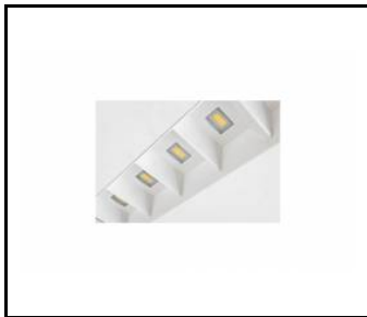
TERRA 2 LED