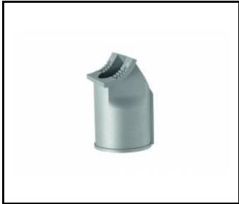
mounting grip 76mm (UL00141)