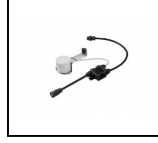
OCULUS LED - RCR motion sensor (964244)