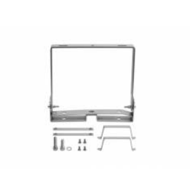
OCULUS LED - universal handle-lack of compatibility with Dali version 294W (964886)