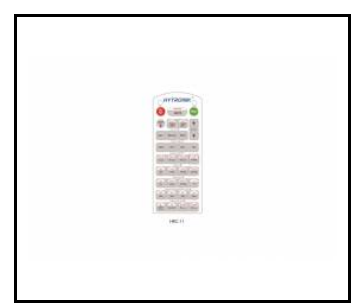
WSEL415 Remote control for - PIR sensor (WSEL415)