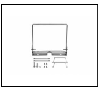
OCULUS LED - universal handle-lack of compatibility with Dali version 294W (964886)