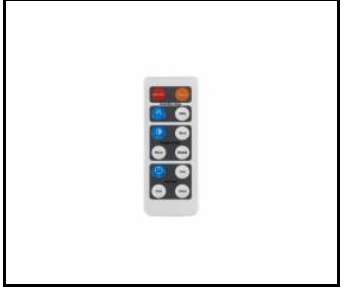
Remote control for motion sensor HD01R (WSEL438)