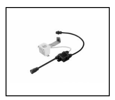
OCULUS LED - RCR / PIR DALI motion sensor (963674)