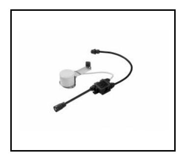
OCULUS LED - RCR motion sensor (964244)