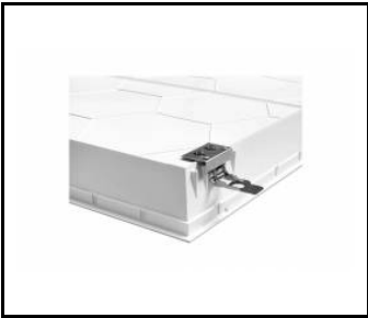
Plasterboard mounting brackets (4 pcs) (630033)