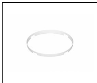
Ceiling ring Dione LED steel 1.5 white matt RAL 9003 painted vandal resistant (120DL118)