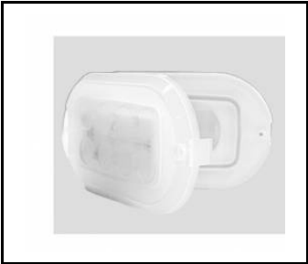
Oval LED Basic 840 (4.7W) light module (233661)