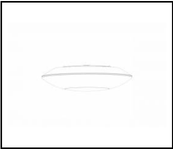
CAPELLA LED EDGE

Card creation date: 23 September 2020 The company reserves the right to make design changes or upgrades in the presented product. Product data sheet does not constitute an offer. * Parameter tolerance is +/- 10%