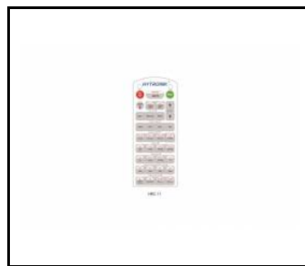
WSEL415 Remote control for - PIR sensor (WSEL415)