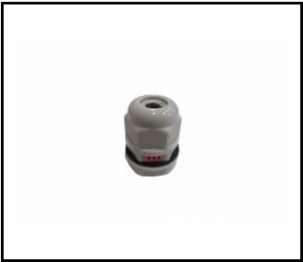
Breathable gland gray M20*1.5 IP68 (16000507)