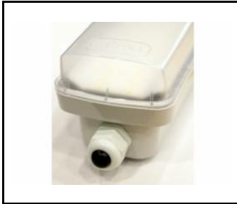
M16 stuffing box plug various PA black M-16 - BPM-21 (60000006)