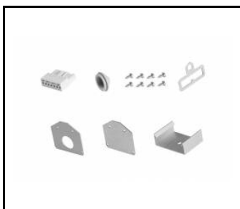
LINEA 2 LED - closing set (966323)