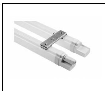
MIMO 2 LED - double handle (set) (100673)