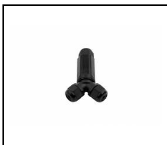
IP68 High-bay PA 6.6 connector black DL06-3A-2Y (800ML208)