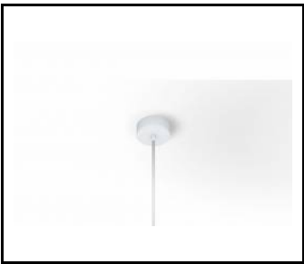
capella led z białą zwiesie