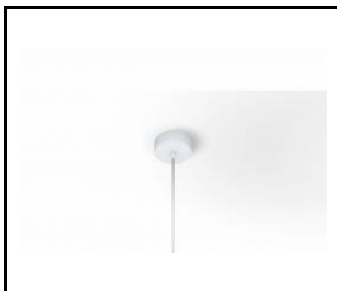
capella led z biala zwiesie