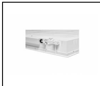
COMPACT LED EVO P ZK SZYBKOZŁĄCZE