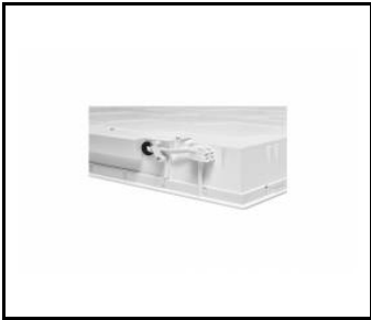
COMPACT LED EVO P ZK SZYBKOZŁĄCZE

Card creation date: 11 July 2025 The company reserves the right to make design changes or upgrades in the presented product. Product data sheet does not constitute an offer. * Parameter tolerance is +/- 10%