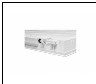
COMPACT LED EVO P ZK SZYBKOZŁĄCZE