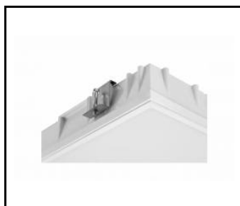
COMPACT LED EVO P ZK UCHWYT MONTAŻOWY