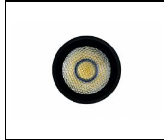
EXPO SYSTEM LED honeycomb (255120)