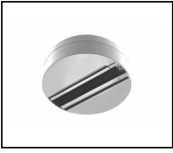
EXPO SYSTEM LED surface mounting base white (255113)