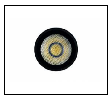
EXPO SYSTEM LED honeycomb (255120)