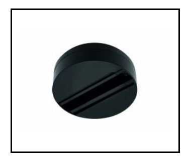
EXPO SYSTEM LED surface mounting base black (255106)