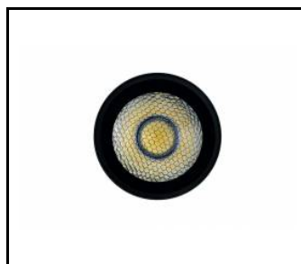
EXPO SYSTEM LED honeycomb (255120)