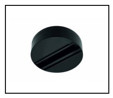
EXPO SYSTEM LED surface mounting base black (255106)