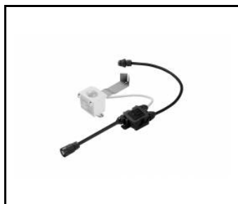
OCULUS LED - RCR / PIR DALI motion sensor (963674)