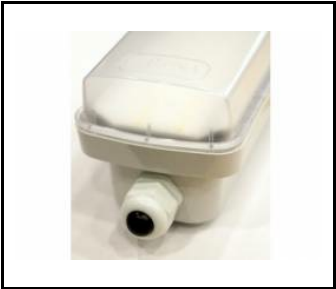
M16 stuffing box plug various PA black M-16 - BPM-21 (60000006)