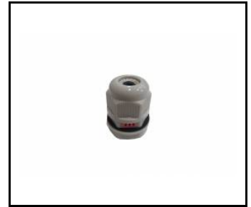
Breathable gland gray M20*1.5 IP68 (16000507)