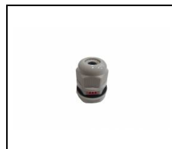
Breathable gland gray M20*1.5 IP68 (16000507)