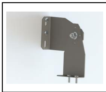
TYTAN LED. ATLAS LED. INDUSTRY LED - adjustable handle (set of 2) (908200)