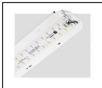
TYTAN MULTI LED 1450mm 3150-5450lm 840 - lighting module (358951)