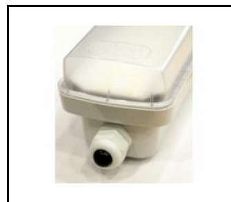
M16 stuffing box plug various PA black M-16 - BPM-21 (60000006)