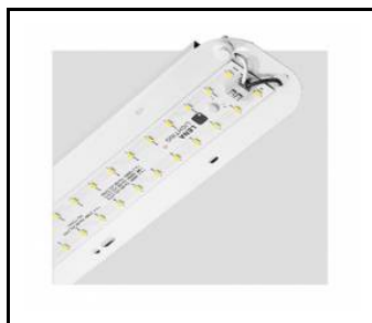
TYTAN MULTI LED 1150mm 5000-8700lm 840 - lighting module (358944)