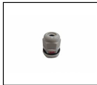
Breathable gland gray M20*1.5 IP68 (16000507)