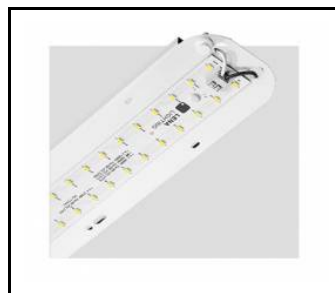
TYTAN MULTI LED 1450mm 3150-5450lm 840 - lighting module (358951)