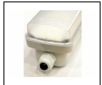
M16 stuffing box plug various PA black M-16 - BPM-21 (60000006)