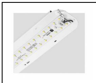
TYTAN MULTI LED 1150mm 5000-8700lm 840 - lighting module (358944)