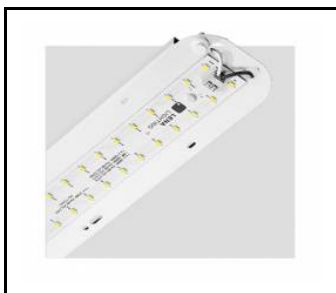
TYTAN MULTI LED 1150mm 2500-4300lm 840 - lighting module (358937)