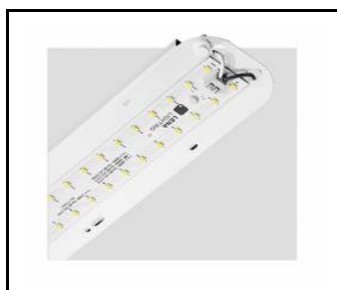
TYTAN MULTI LED 1150mm 5000-8700lm 840 - lighting module (358944)