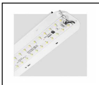
TYTAN MULTI LED 1150mm 2500-4300lm 840 - lighting module (358937)