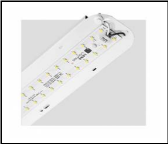
TYTAN MULTI LED 1150mm 2500-4300lm 840 - lighting module (358937)