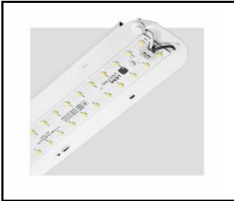
TYTAN MULTI LED 1450mm 3150-5450lm 840 - lighting module (358951)