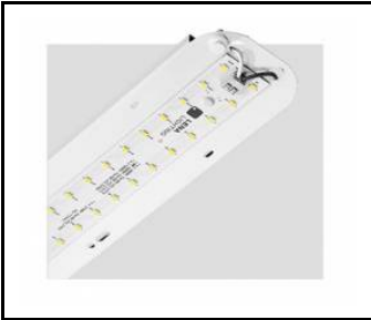
TYTAN MULTI LED 1150mm 5000-8700lm 840 - lighting module (358944)