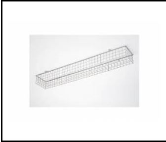
TYTAN LED. ATLAS LED - protective grid 1432mm (907920)