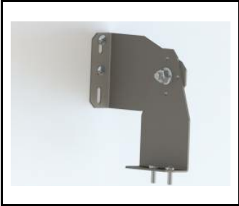
TYTAN LED. ATLAS LED. INDUSTRY LED - adjustable handle (set of 2) (908200)