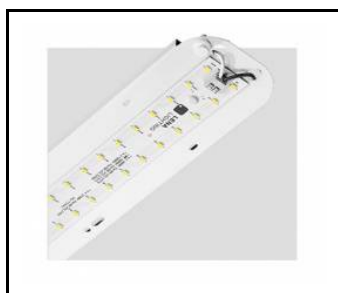
TYTAN MULTI LED 1150mm 2500-4300lm 840 - lighting module (358937)