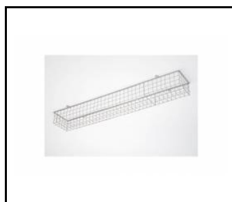
TYTAN LED. ATLAS LED - protective grid 1432mm (907920)