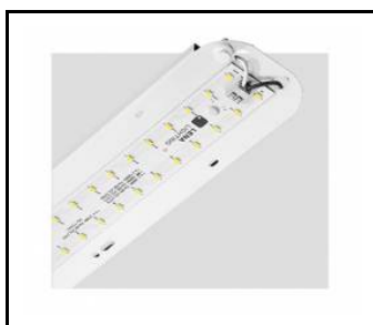
TYTAN MULTI LED 1150mm 5000-8700lm 840 - lighting module (358944)