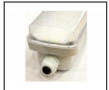
M16 stuffing box plug various PA black M-16 - BPM-21 (60000006)