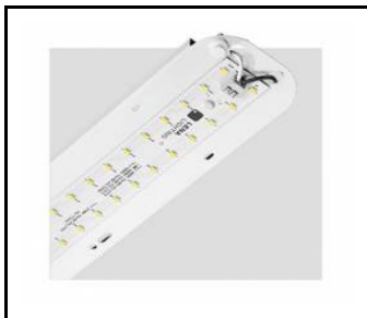
TYTAN MULTI LED 1150mm 2500-4300lm 840 - lighting module (358937)