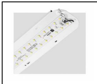
TYTAN MULTI LED 1150mm 5000-8700lm 840 - lighting module (358944)