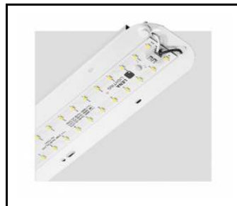
TYTAN MULTI LED 1450mm 3150-5450lm 840 - lighting module (358951)