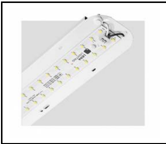
TYTAN MULTI LED 1450mm 3150-5450lm 840 - lighting module (358951)