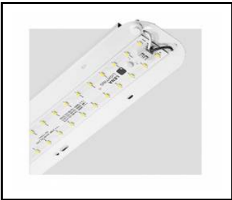
TYTAN MULTI LED 1150mm 2500-4300lm 840 - lighting module (358937)