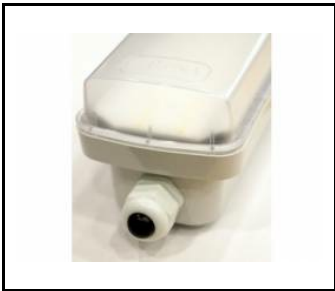
M16 stuffing box plug various PA black M-16 - BPM-21 (60000006)