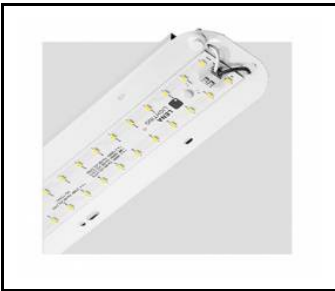
TYTAN MULTI LED 1150mm 5000-8700lm 840 - lighting module (358944)