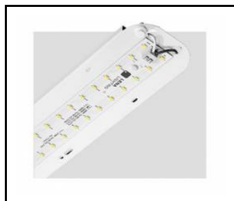
TYTAN MULTI LED 1450mm 3150-5450lm 840 - lighting module (358951)