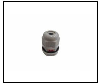
Breathable gland gray M20*1.5 IP68 (16000507)