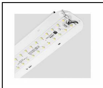
TYTAN MULTI LED 1150mm 5000-8700lm 840 - lighting module (358944)