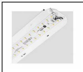
TYTAN MULTI LED 1450mm 3150-5450lm 840 - lighting module (358951)