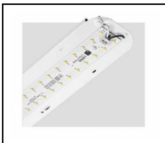
TYTAN MULTI LED 1150mm 2500-4300lm 840 - lighting module (358937)