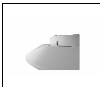
CAPELLA LED BOX ANTIVANDAL