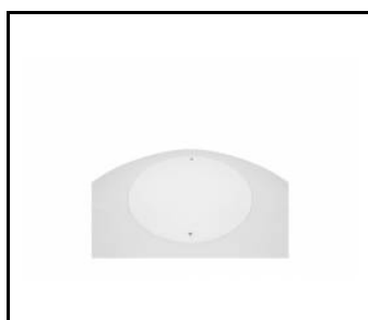
CAPELLA LED EDGE ANTIVANDAL