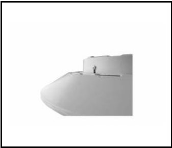
CAPELLA LED BOX ANTYWANDAL

Card creation date: 17 February 2025 The company reserves the right to make design changes or upgrades in the presented product. Product data sheet does not constitute an offer. * Parameter tolerance is +/- 10%