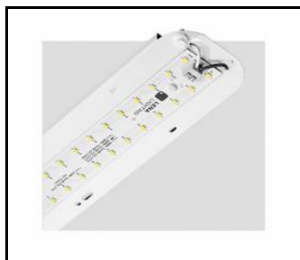
TYTAN MULTI LED 1150mm 5000-8700lm 840 - lighting module (358944)