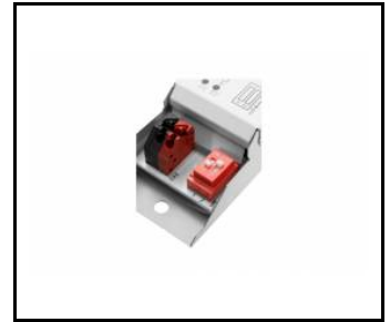
tytan multi led