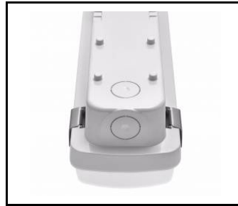
wybór miejsca zasilania / choosing a place of power supply / Stromversorgungsanschluss von mehreren Seite möglich