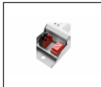
tytan multi led