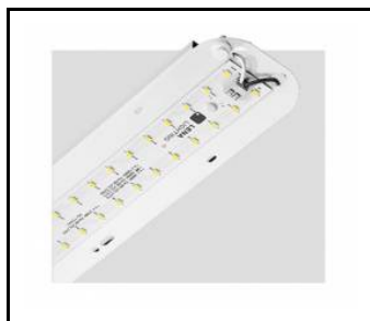
TYTAN MULTI LED 1150mm 2500-4300lm 840 - lighting module (358937)