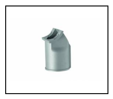
wall holder (galvanized) (314049)